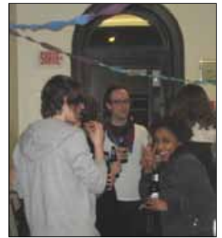
SdBI students enjoying each other's company