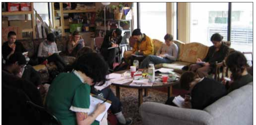
A workshop in progress...