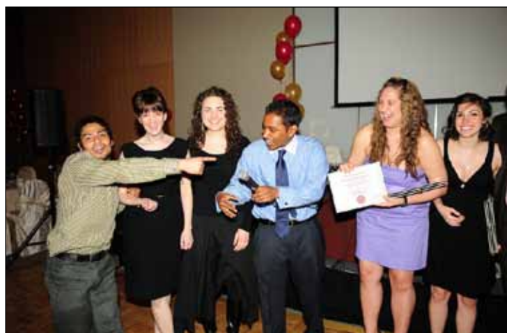
WSSA members enjoying the Spring Ball