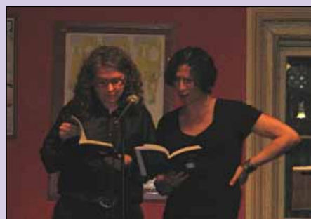
Poets in harmony