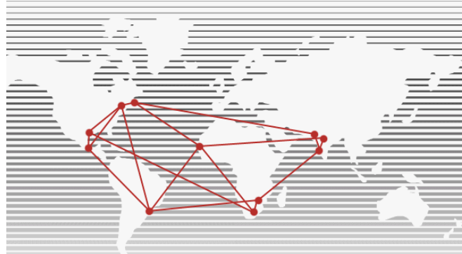
Networks: Discovering Shared Meaning and Purpose

Stage One: Networks. We live in a time when coalitions, alliances and networks are forming as the means to create societal change. There are ever more networks and now, networks of networks. These networks are essential for people finding like-minded others, the first stage in the life-cycle of emergence. It's important to note that networks are only the beginning. They are based on self-interest--people usually network together for their own benefit and to develop their own work. Networks tend to have fluid membership; people move in and out of them based on how much they personally benefit from participating.